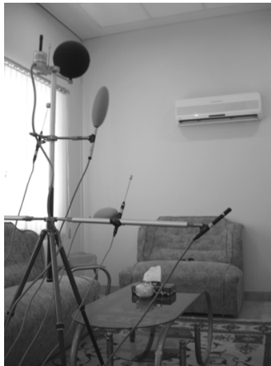
Figure 1. Laboratory room for comfort measurement

As it was mentioned earlier, data logger – thermal comfort unit was utilized in this research to quantify comfort (Fig. 1). [1]