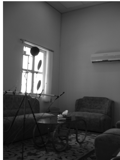
Case D: height=3750mm-4000mm