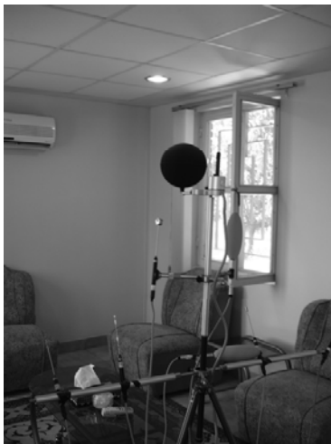
Case A: height=2100mm-2200mm

The laboratory environment is hence adjusted according to climatic conditions of the reference space so that individuals may feel the same thermal state except that with the possibility so evolved to change the floor-to-ceiling distance, their rate of satisfaction in conditions similar to those of the reference environment and in different ceiling heights is investigated. In this way, it would become clear whether dissatisfaction originates in floor-to-ceiling distance or not. It is worth noting that during the test, changes in height would lead to no tangible difference regarding thermal conditions in the space inside the laboratory (this is controlled by the thermal comfort unit) [1].