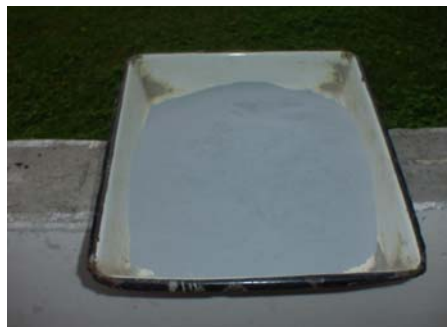
Plate 1. Silica fume