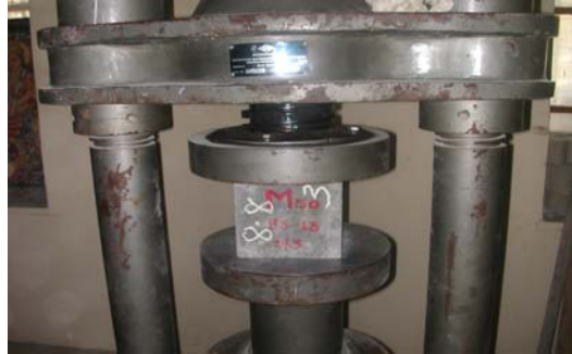
Plate 3. Test for Compressive strength of Concrete