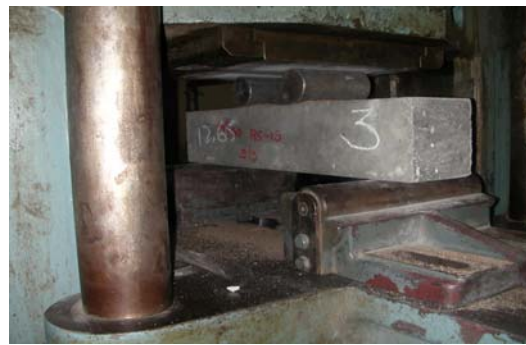
Plate 4. Test for flexural strength of Concrete