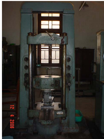
Plate 5. Test setup for Stress –Strain Curve of C