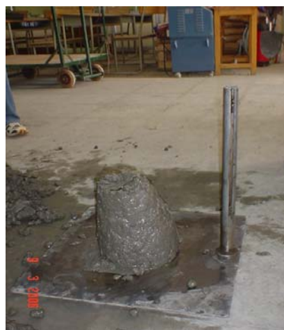
Plate 2. Slump Measurements